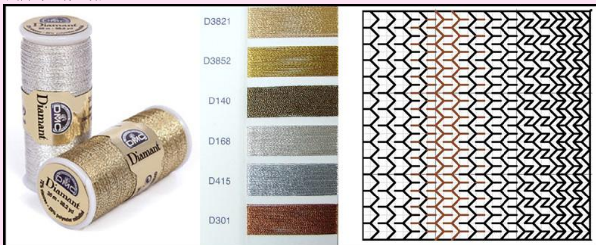
Extract from Copper Canvas using D301 Copper

Diamant is widely available in the UK, but in many parts of the world it is still only available via the internet.