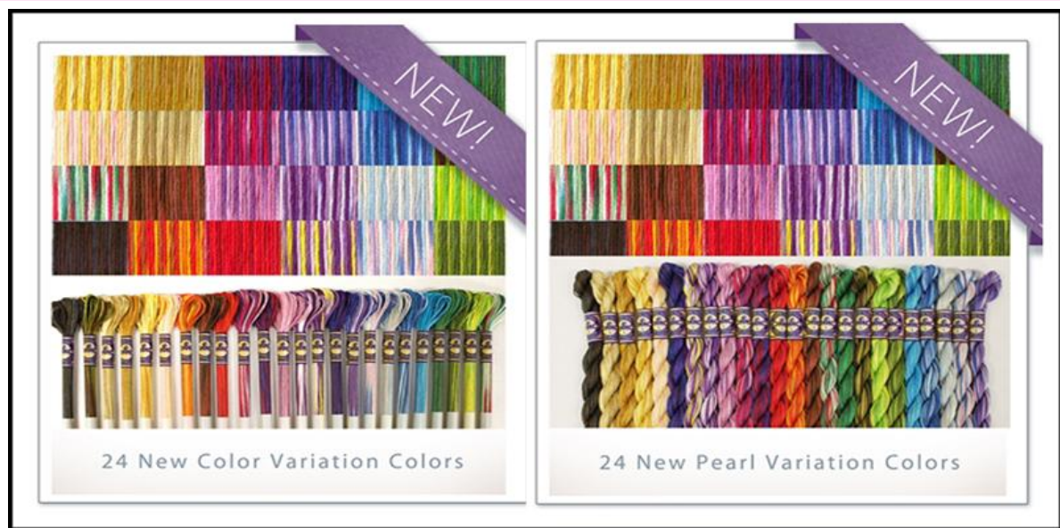
DMC new additions to the Colour Variations range

DMC has also introduced 24 NEW Colour Variations colours to the Colour Variation line of specialty threads. These are available in six strand divisible embroidery cotton skeins and Pearl Cotton skeins size 5. DMC Colour Variations are beautiful multi-coloured threads designed to give the look of hand-dyed thread whilst being colourfast and fade resistant.