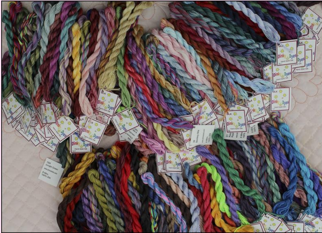
Threads by Dinky Dyes – delicious colours!