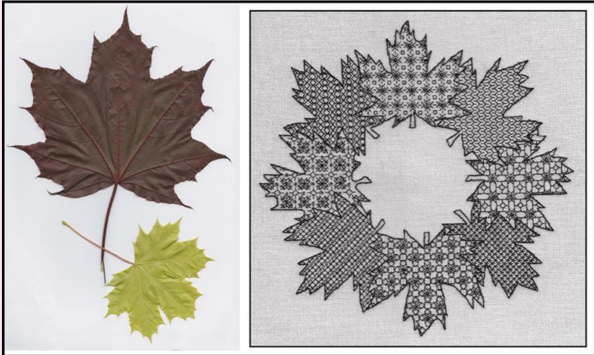
CH0308 'Maple Leaf Wreath' - a free style counted thread design worked on 28 count evenweave

Summer is finally here in northern England after one of the coldest Spring's we have experienced for a long time. Everything in the garden was at least a month late coming into leaf and the bluebells, which should have flowered in early April, have only just finished flowering, but what a joy to see the fresh green leaves and hear the birds in the trees around the house. However, our maple tree has provided some fresh new leaves and inspired my latest project, CH0308 'Maple Leaf Wreath' and been an inspiration for several others.