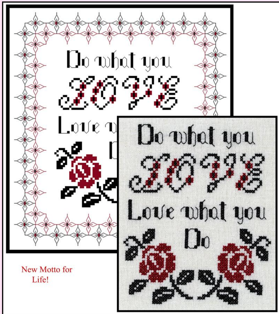
CH0309 Do what you Love.....